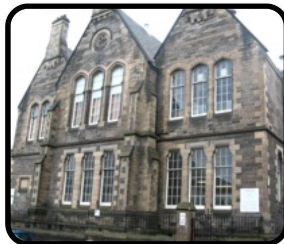
South Bridge Resource Centre